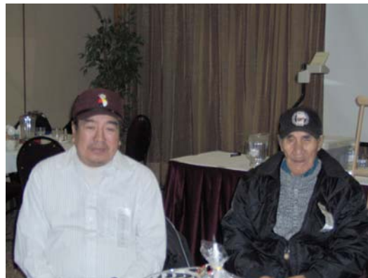
Elders at the First Nations Elders' Forum "Spirit and Intent of the Treaties" In Winnipeg, MB March 14 & 15, 2006