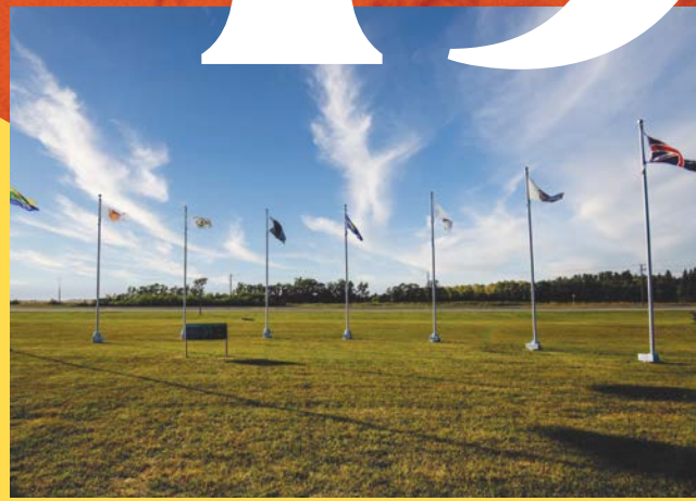
The Numbered Treaties, 1871 to 1921, were integral to the growth and development of Canada and are foundational agreements that continue to guide us today.

There are seven different Treaty territories in present-day Manitoba: Treaty No. 1, Treaty No. 2, Treaty No. 3, Treaty No. 4, Treaty No. 5/Treaty No. 5 Adhesion, Treaty No. 6, and Treaty No. 10. Dakota traditional territory is located in southwestern Manitoba. Treaty No. 9 forms the northeastern point of the province; however, there are no communities there. All Manitobans reside within a Treaty territory.